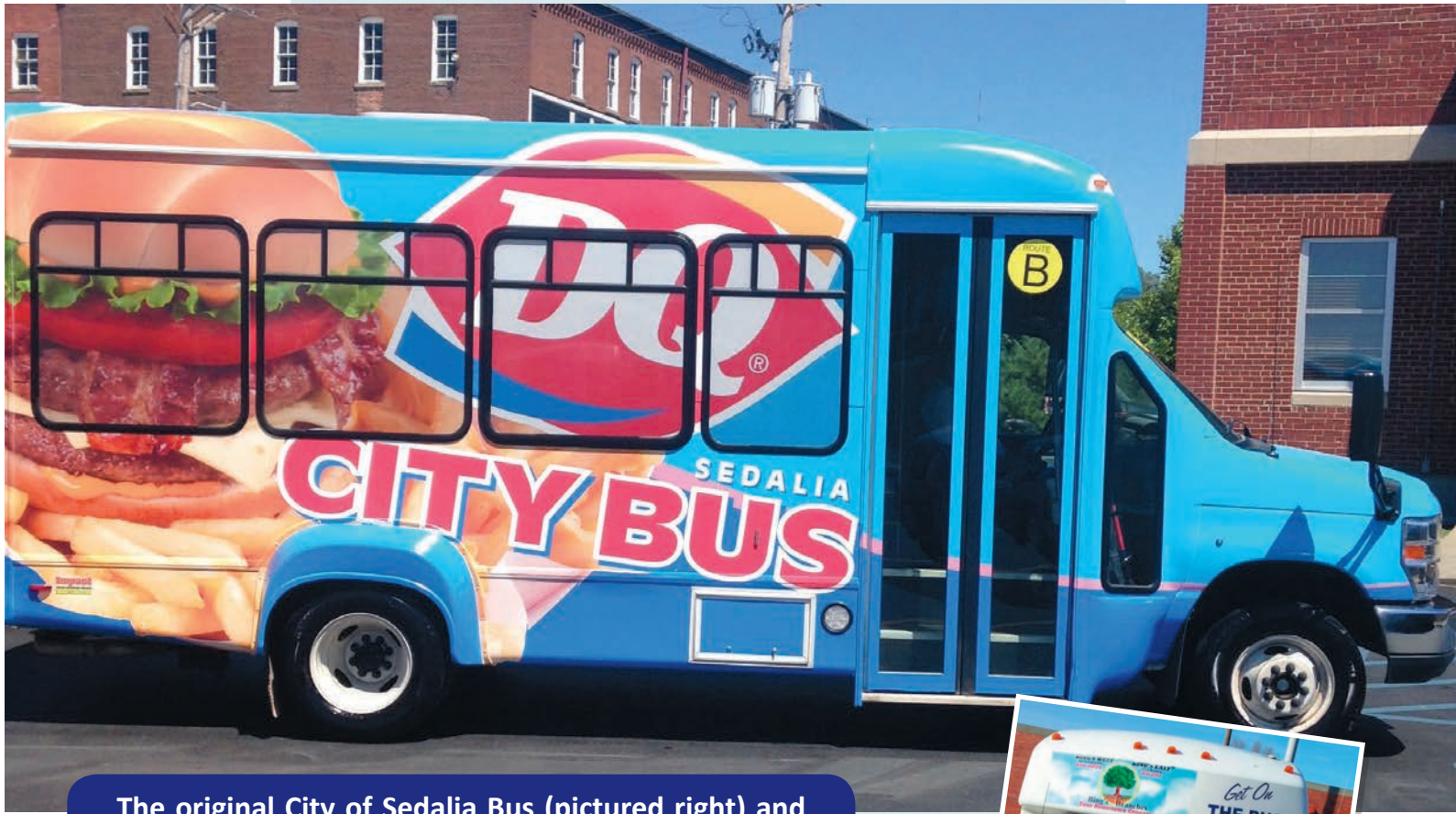
The original City of Sedalia Bus (pictured right) and The Bus today (pictured above).